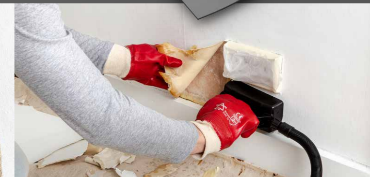
Small steam plate (SteamForce Plus)