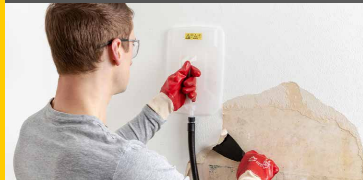
Scraper (SteamForce Plus)